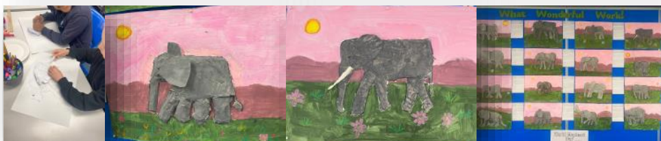
Mrs Sinclair Wattle 3 Teacher

It was a glorious, misty morning. The small birds were singing beautifully in the quiet breeze. The elephants slowly stood up on the damp grass and sniffed the cold air, which tickled their noses. ~ Ella