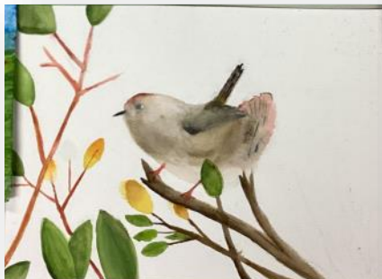
Ms Phillips Banksia 5 Teacher

Some of the children chose to enter their pieces into a national art competition called Wild at Art . Look out for some of the art on display during Science Week. We hope viewers will be reminded of the unique wildlife we are lucky to have in Australia and the importance of protecting it for species survival.